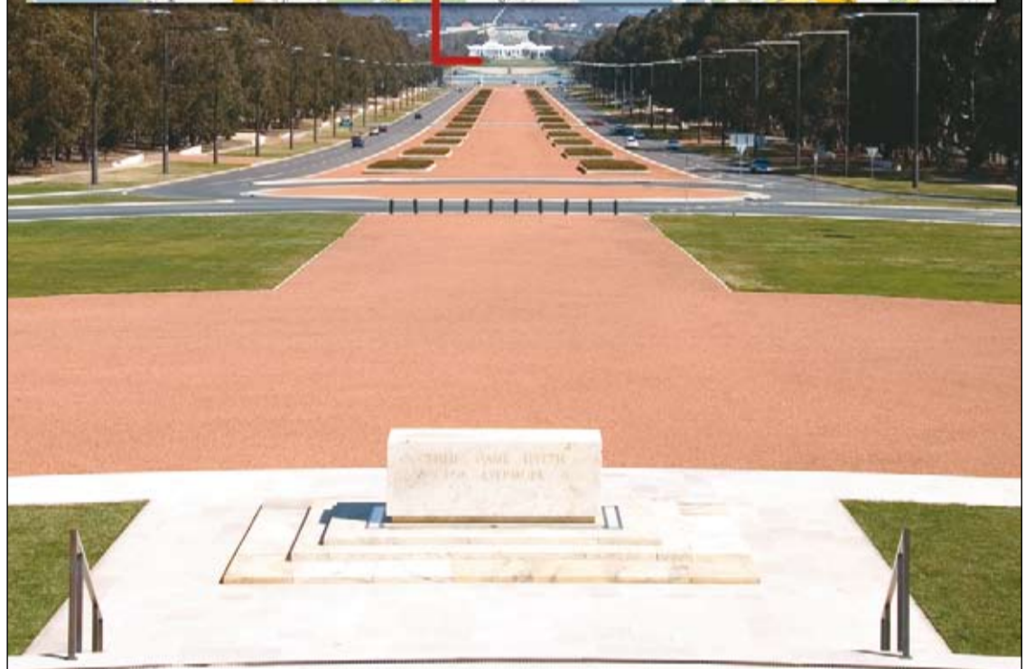
Looking south-west from the steps of the Australian War Memorial straight down Anzac Parade towards Old Parliament House and new Parliament House. At the end of Anzac Parade is Lake Burley Griffin, and immediately across the water at the next landfall is Reconciliation Place (between the Lake and Old Parliament House).